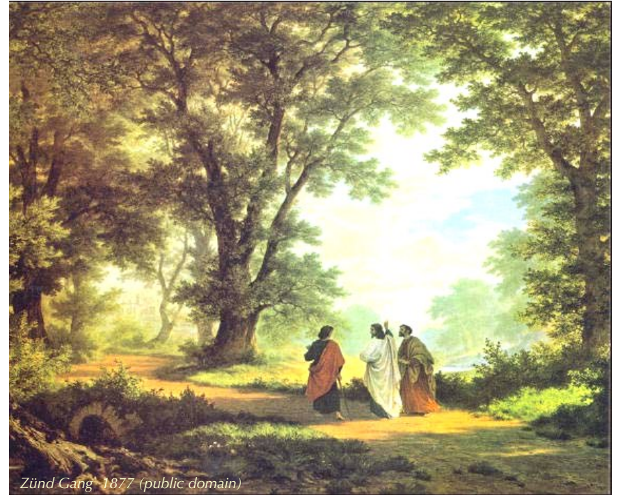
Zünd Gang, 1877

That very day two of them were going to a village named Emmaus...Jesus Himself drew near and went with them...And beginning with Moses and all the Prophets, He interpreted to them in all the Scriptures the things concerning Himself.