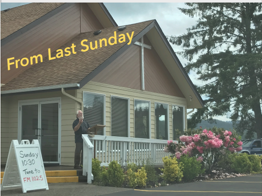
The parking lot services radio services have been working so far -tune into 102.5 @ 10:30 AM. Well, the rain made the pastor dash inside mid-sermon, but he kept on teaching from the foyer!

Since the restrictions are beginning to lift, last week FBC leadership discussed what we should be doing, As of Friday, May 15, we could gather inside our building if there were only 25 of us, but our leaders agreed that we should not "open up" immediately, but that we will continue praying for wisdom while evaluating the situation.